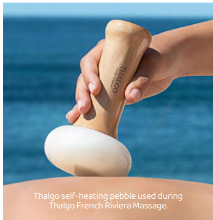
Thalgo self-heating pebble used during Thalgo French Riviera Massage.